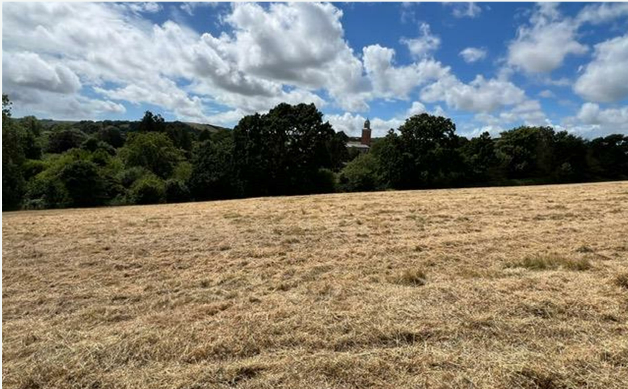
Land to the South of Sandy Lane, Nr Gatcombe, Isle of Wight